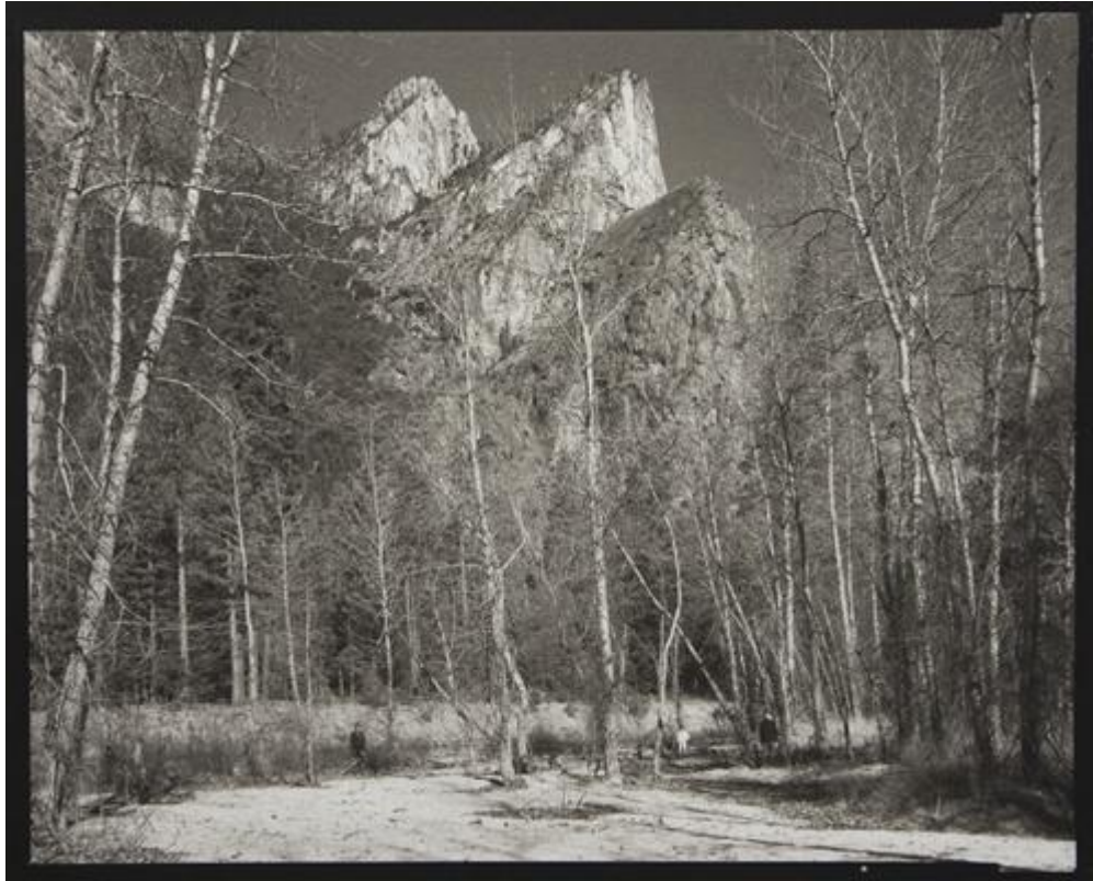
TREES, VALLEY FOG, DUSK, YOSEMITE VALLEY, CA